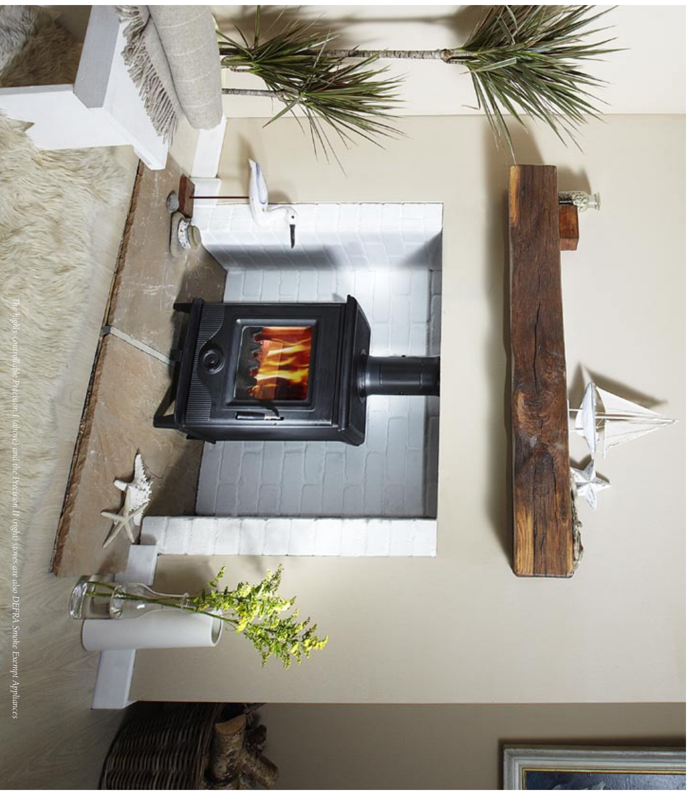
The highly controllable Precision I (above) and the Precision II (right) stoves are also DEFRA Smoke Exempt Appliances

IF PRECISION STOVES were cars then they would definitely be Minis or Beetles – affordable, totally practical and designed to be around for a very long time. Although the Precision stoves incorporate state-of-the-art clean burn combustion technology, featuring pre-heated Tertiary Air, they remain amongst the simplest user-friendly steel bodied stoves in their class – from the ever-so-easy to remove baffle plates to the ultra controllability of their flame patterns. And then there's their astounding value-for-money; ... the cleaner, greener and smarter buy.