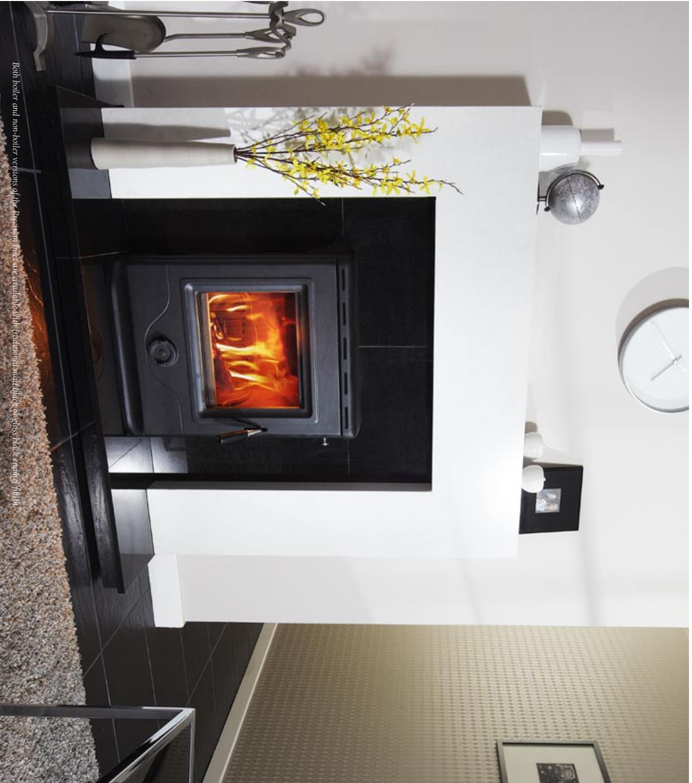
Both boiler and non-boiler versions of the Precision Inset are available with traditional matt black or glass black enamel finish