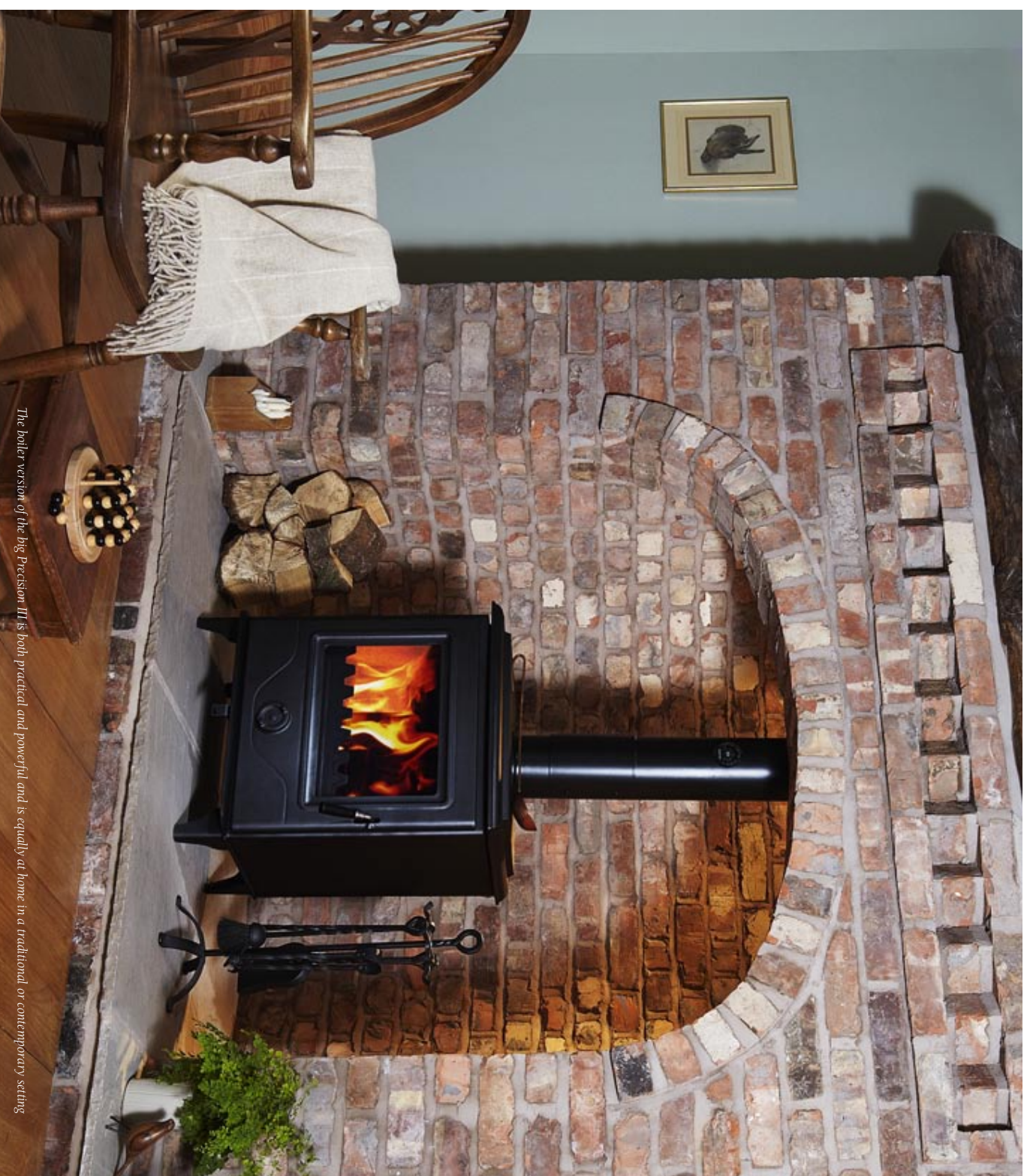
The boiler version of the big Precision III is both practical and powerful and is equally at home in a traditional or contemporary setting.

BOILER STOVES HAVE always been incredibly popular in Ireland but now the rest of us are quickly catching on to their many benefits – not least because of the relatively cheap and plentiful supply of wood fuel that can cut our home's CO2 emissions. And there's also something heart-warming about being energy independent and not being held to ransom by the big energy companies. With this in mind each Precision stove has been designed to maximise efficiency and minimise fuel usage and that includes both of our big boiler stoves. Precision multi fuel boilers have also been tested to burn efficiently and safely overnight so that your family can have plenty of hot water on tap 24-seven as well as a hot radiator in every room in all but the very largest of homes.